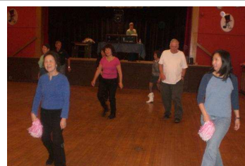
Quickstepper Fun – Prop Night