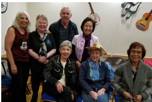
February 17th "Grand Ole Opry"