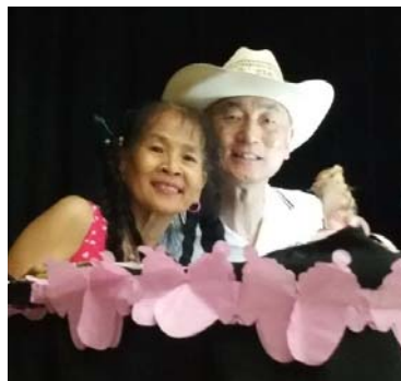
January 6th “Baby Face”