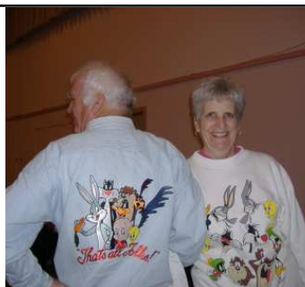
April 4th was our "Looney Tunes" dance