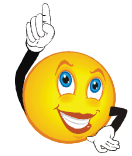
MARCH 1st—Saddle Sores

You don't stop dancing because you grow old..... You grow old because you stopped dancing!