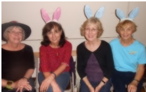
APRIL 19 EASTER BONNET