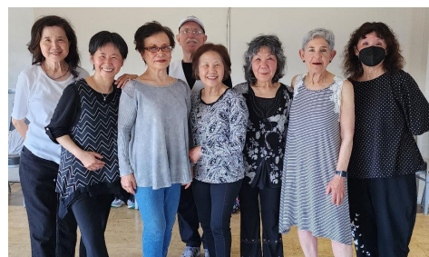
MAY 18th Black & White Ball