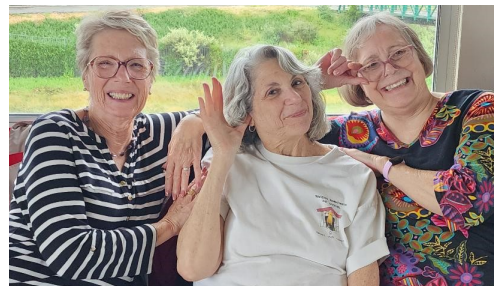
MAY 4th Cinco de Mayo