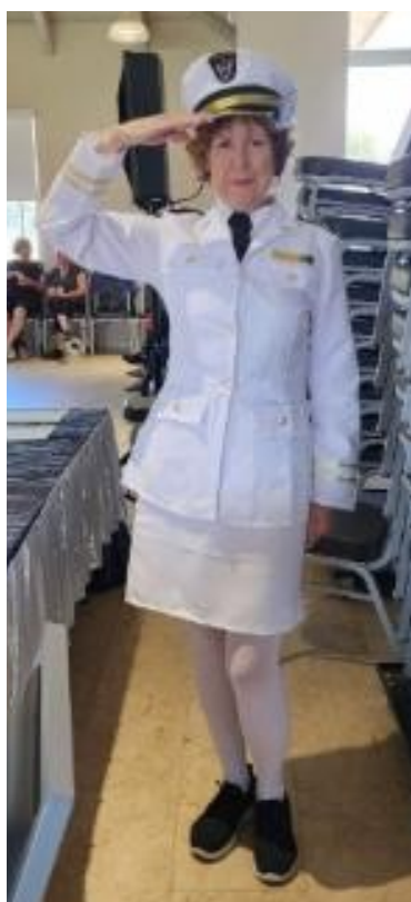
June 15th “Yacht Club”