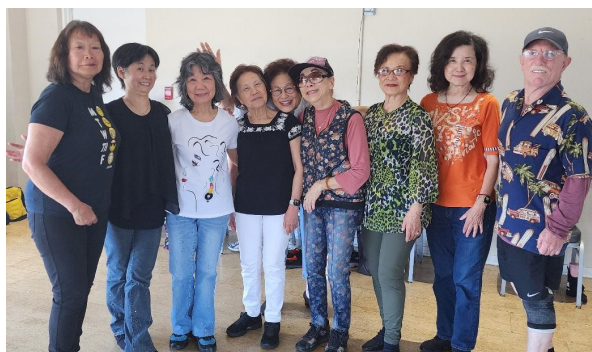
June 1st “Smiley Face”