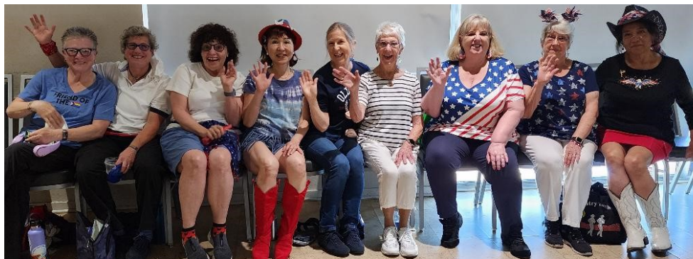
JULY 6th “Red, White, & Blue”