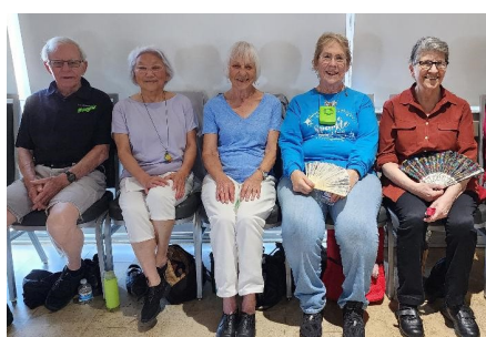
JULY 20th DJ and Teacher Appreciation